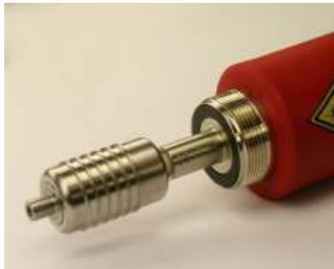
FIBERPOINT® 250 with Adapter