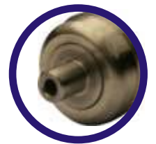
Ferrule 1.25 mm