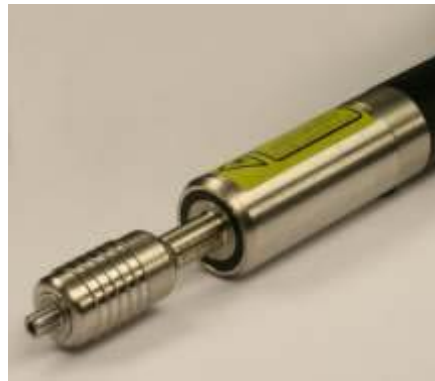
FIBERPOINT® 250MD with Adapter